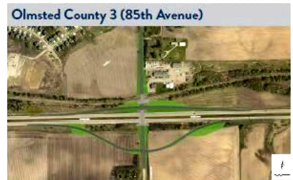
Olmsted County 3 (85th Avenue) Diamond Interchange

For more information, visit www.olmstedcounty.gov