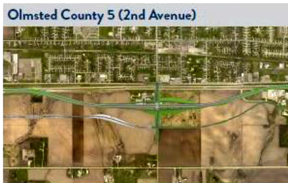
Olmsted County 5 (2nd Avenue) Single Point Interchange (south of US 14), with US 14 realignment

Currently, the intersection at County Road 3 has been converted to a J-turn, while the intersection at County Road 5 continues to experience approximately one accident per month, both now and historically.