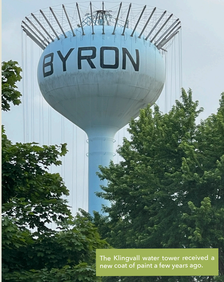
The Klingvall water tower received a new coat of paint a few years ago.

At their January meeting, Byron city council members approved water and sewer rate increases for 2026. These increases are based on a study completed two years ago which detailed how much money would be needed in the future for Byron to maintain the infrastructure for the water and sewer utilities. Infrastructure includes everything from the wastewater treatment plant to the city's water towers and all equipment in between that is the city's responsibility.